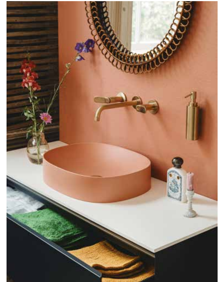
BASIN: The Maia Round Basin in Soft Pink